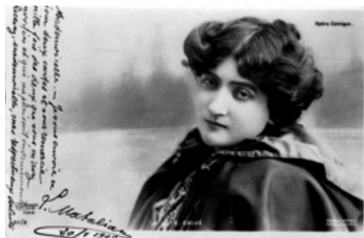
3606. Emma Calvé

2344 Pathé 5311 +piano: E lucean le stelle "Tosca" (Puccini) mx.84004/ Qui sotto il ciel "Ugonotti" (Meyerbeer) mx.84006 Milan 1903 3 rubs, few mostly lt.scrs. MB 40