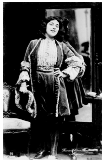
3610. Geraldine Farrar