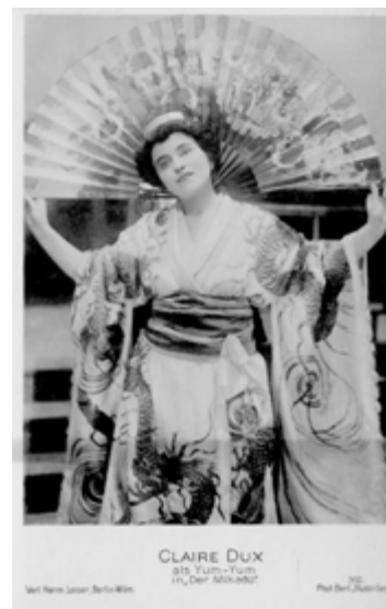
3607. Claire Dux