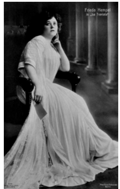
3614. Frieda Hempel