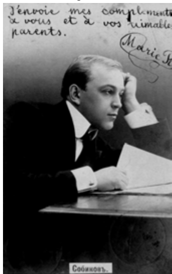
3630. Leonid Sobinov