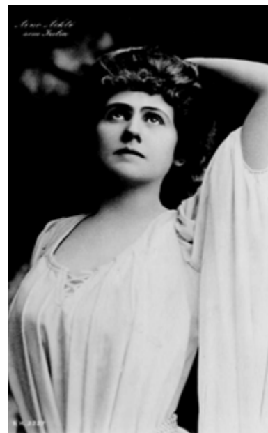
3600. Aino Ackté