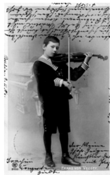
3631. Franz Vecsey