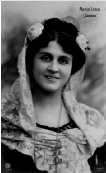
3621. Maria Labia