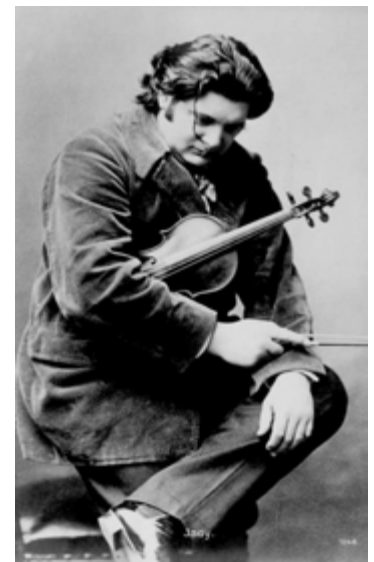
3634. Eugène Ysaye