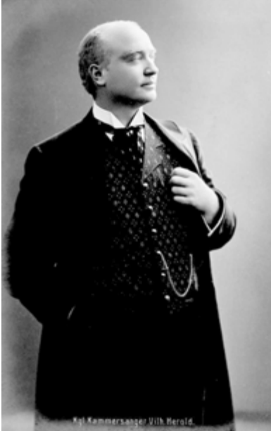
3615. Vilhelm Herold