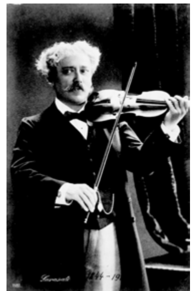
3627. Pablo Sarasate

2824 12" s/s acoust. black predog 07912 +piano: Nocturne in A minor, op.42 (Hubay) mx.2679 f London 1908 Scarce ! stamper IV 2 few small rubs MB 100