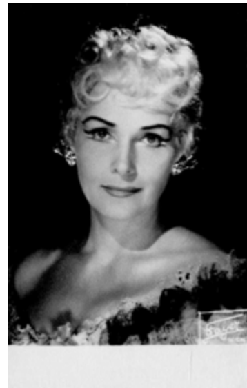
3629. Elisabeth Schwarzkopf